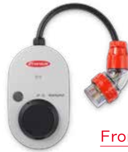
Fronius Watto pilot

The consumption controller regulates the water heating system in a stepless manner with excess current. The advantages for you: Loss-free energy utilisation and even lower CO 2 emissions.